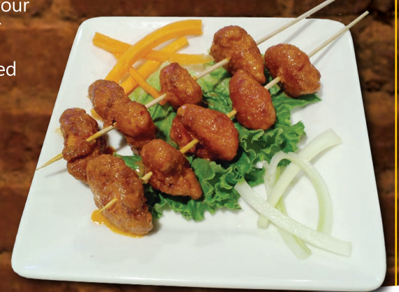
BONELESS HOT WINGS